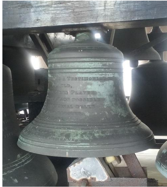
Bell No. 14 - F above high C

We the pupils of the Minneapolis Public Schools Give This Bell That "The Star Spangled Banner" may Say to Our Citizens "Liberty and Peace for All"