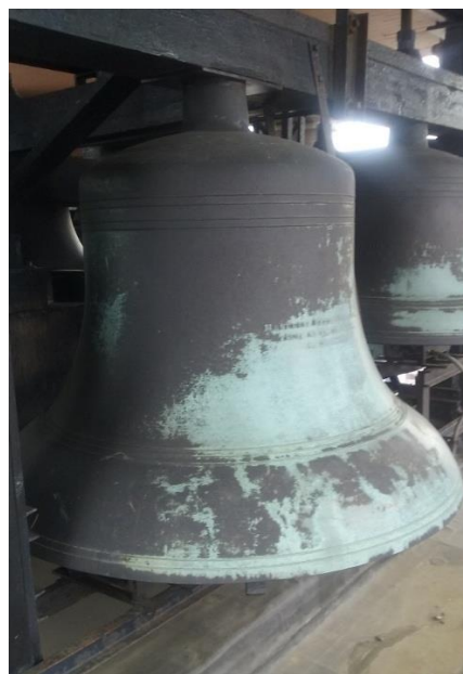
Bell No. 2 - D above middle C