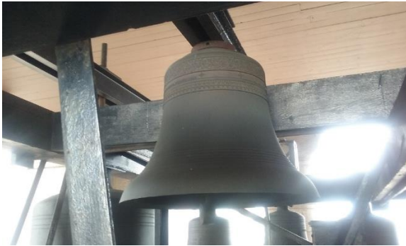
Bell No. 11 - C# above high C