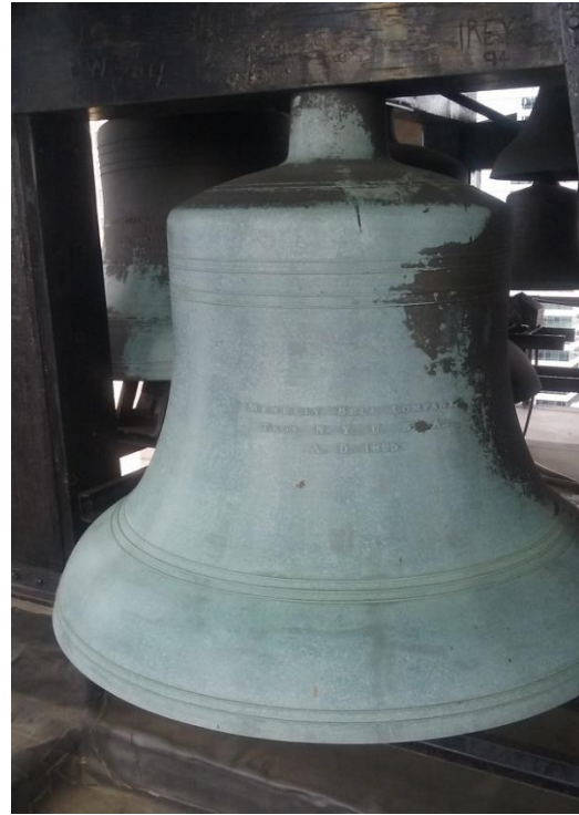
Bell No. 4 - F above middle C