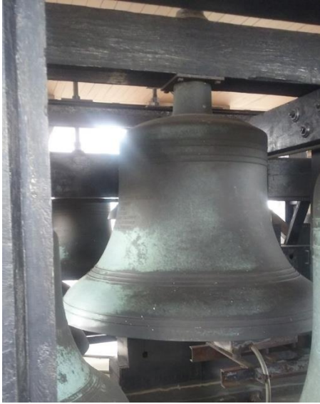
Bell No. 5 - F# above middle C