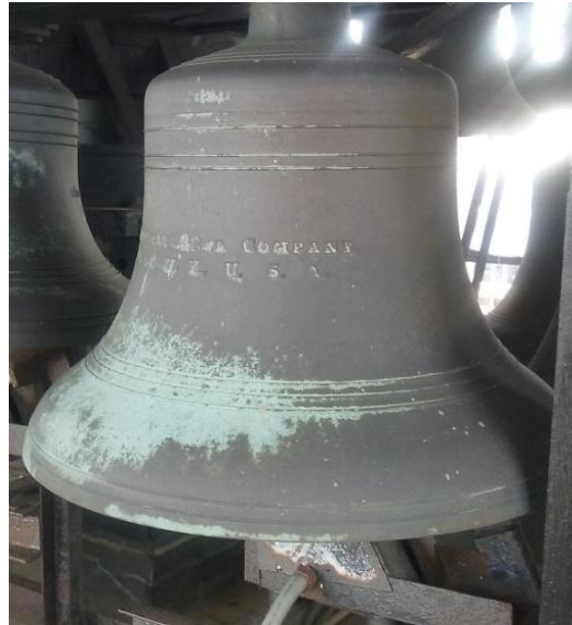
Bell No. 12 - D above high C