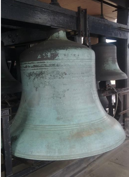
Bell No. 1 - middle C

Here are the vital statistics for each of the bells that comprise the instrument.