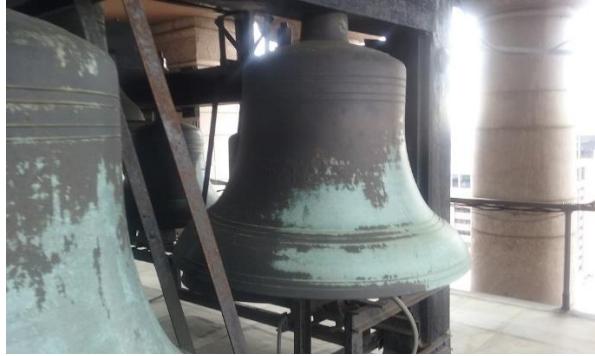
Bell No. 6 - G above middle C