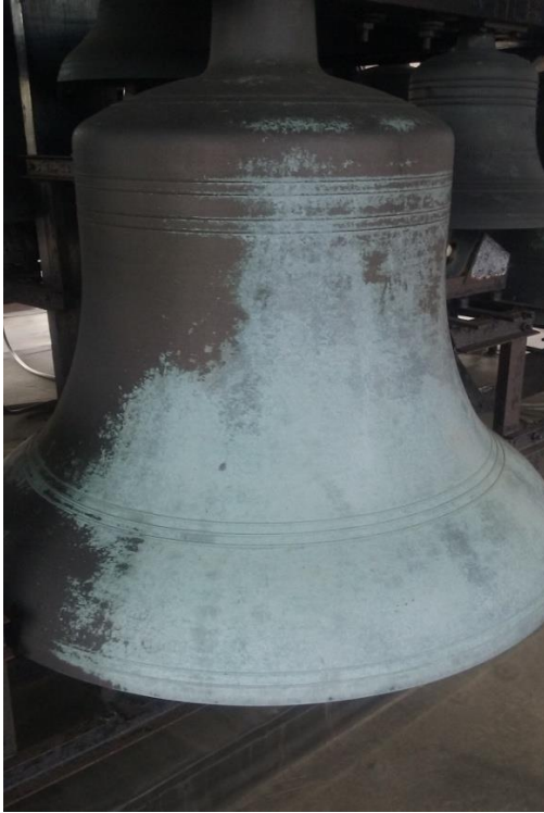
Bell No. 3 - E above middle C