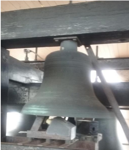
Bell No. 13 - E above high C